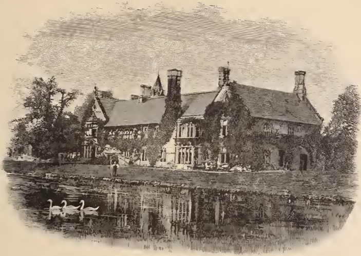
THE ABBEY, BURTON-ON-TRENT, THE BIRTHPLACE OF BISHOP FRENCH.