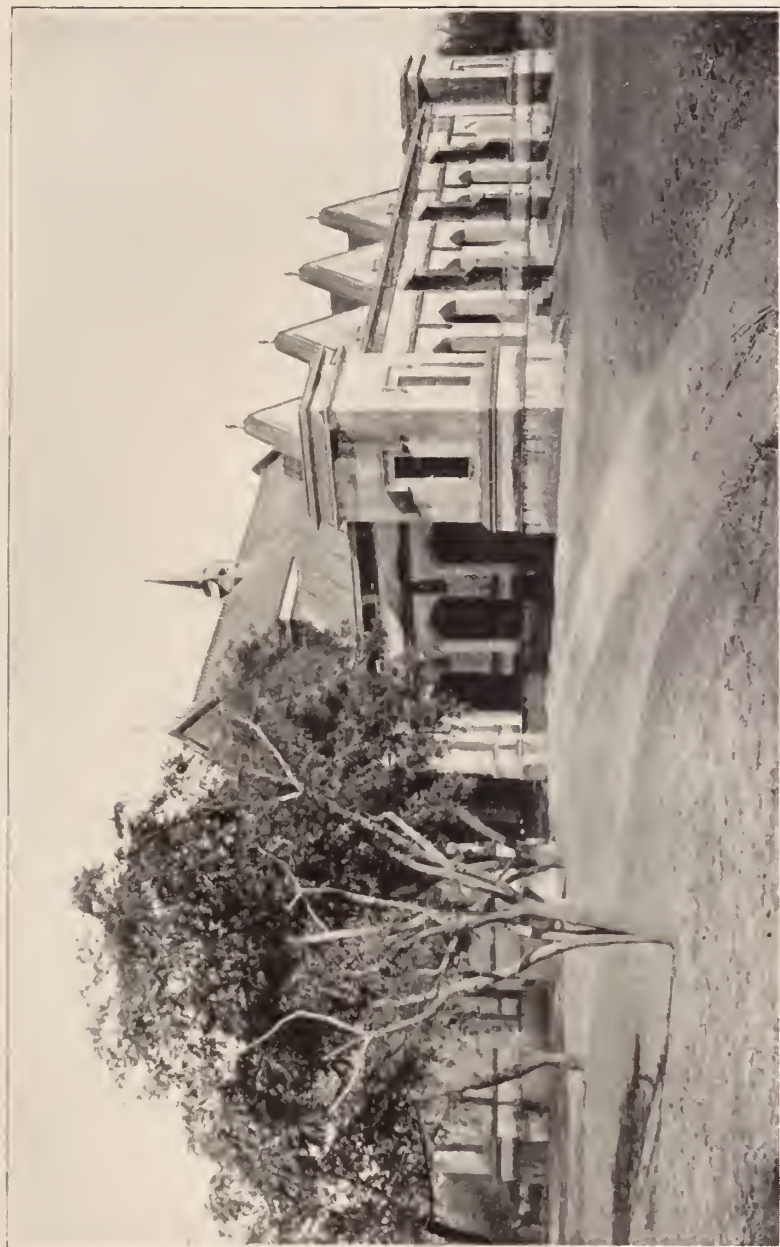
ST. JOHN'S COLLEGE AT AGRA