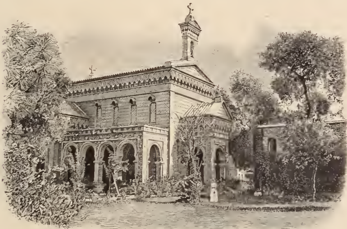
THE CHAPEL, ST. JOHN'S COLLEGE. LAHORE.