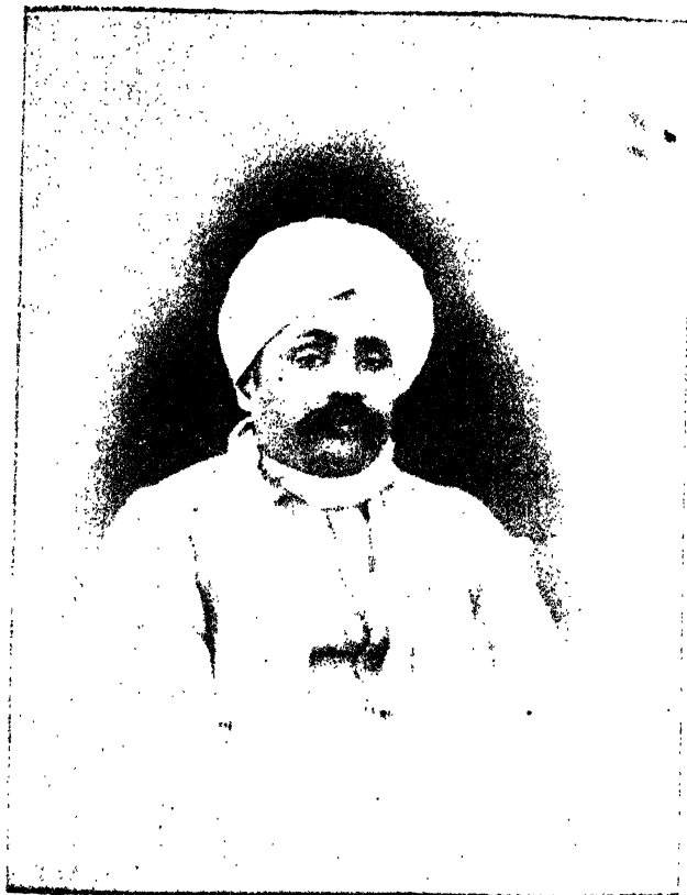
LALA LAJPAT RAI.