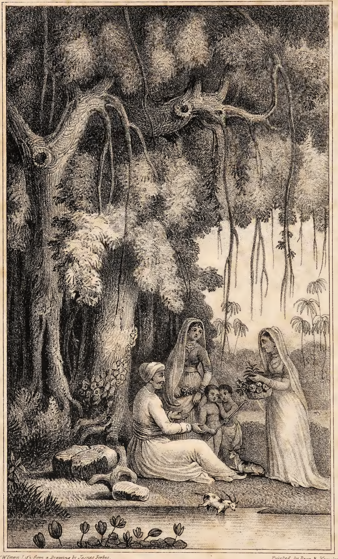
Printed by Dean & Munday.