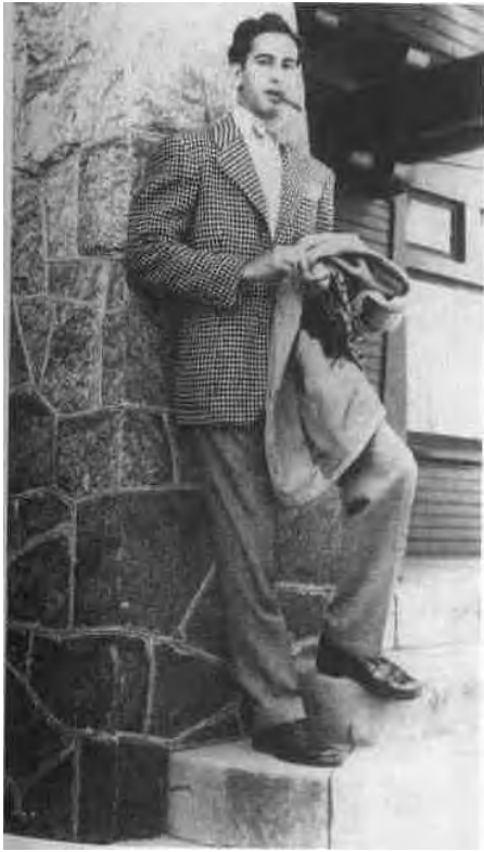
Left: Zulfi Bhutto in California, 1948.