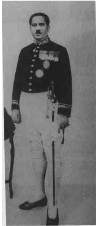
Sir Shah Nawaz Bhutto, c. 1930.