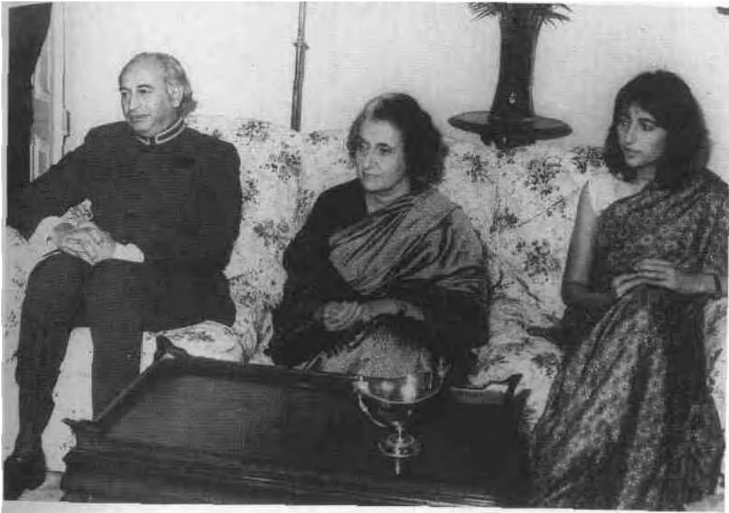
At Simla, President Z. A. Bhutto, Prime Minister Indira Gandhi, and Benazir Bhutto, summer of 1972.