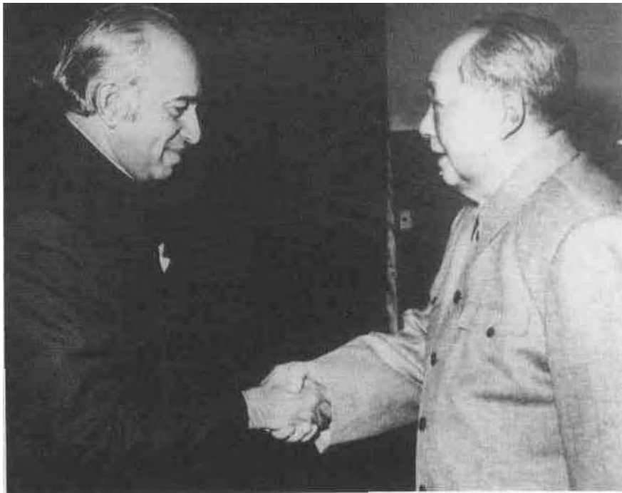
Chairman Bhutto and Chairman Mao, Sino-Pakistan summit. May 1974.