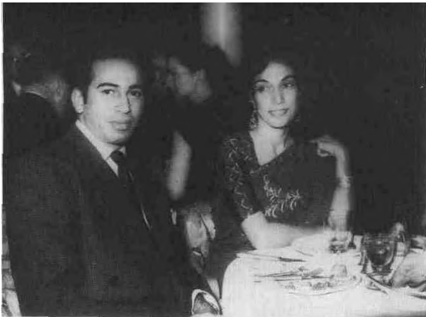
Top: Zulfikar Ali Bhutto in London with his bride, Begum Nusrat Bhutto, 1953.