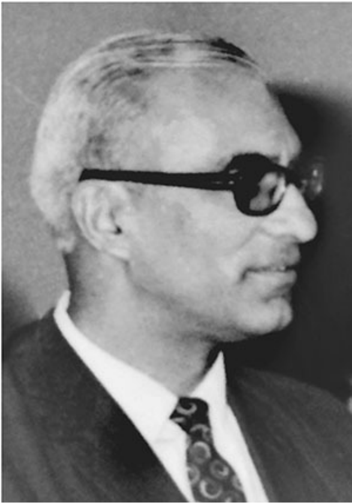
R.T. Nagrani, director general, security (April 1984) and later founderdirector general of National Security Guards.