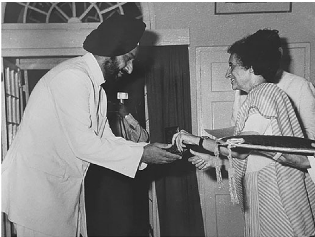
Author receiving Indian Police Medal (IPM) for meritorious service from Prime Minister Indira Gandhi at 1 Akbar Road New Delhi in July 1976.