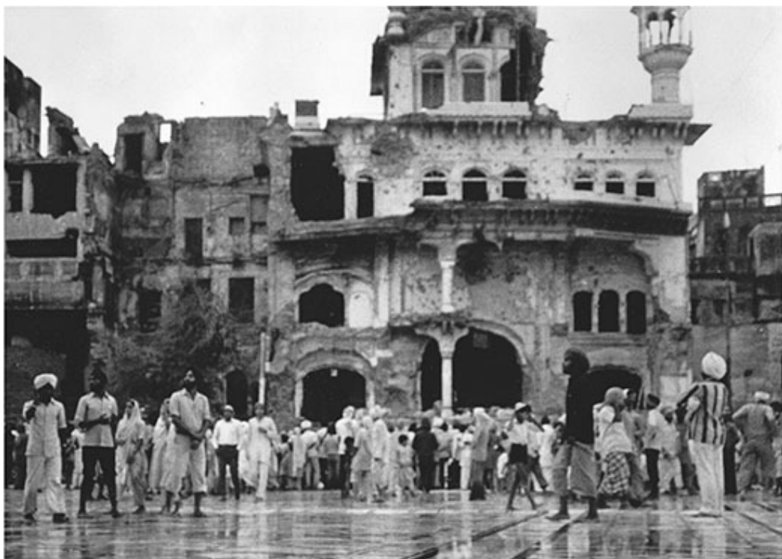
Photo of damaged Akal Takht taken by Sandeep Shankar on the day Golden Temple complex was opened to the public. Courtesy of Sandeep Shankar.