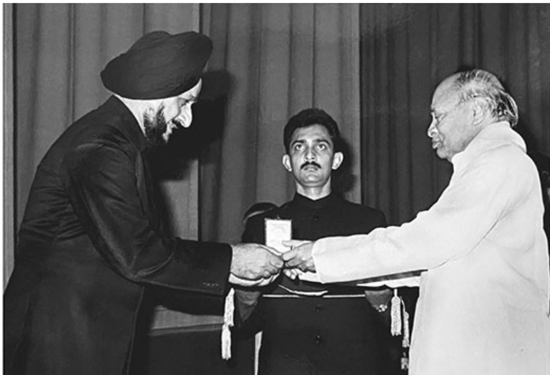
Author receiving President's Police Medal (PPM) for distinguished service from Prime Minister Narasimha Rao in 1994.