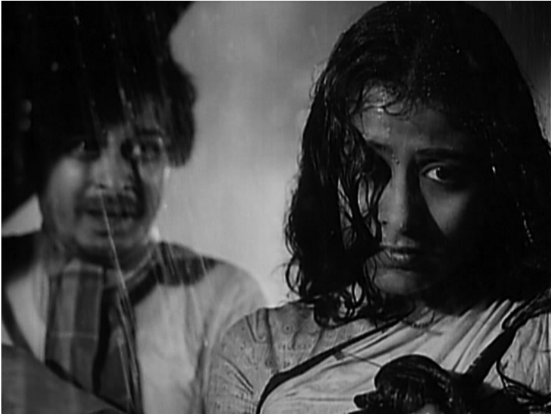
Figure 3.1 Neeta prepares to leave home. Meghe Dhaka Tara by Ritwik Ghatak.

life. A photograph captures the image of Shankar and Neeta, twin figures holding hands, standing against the immense hills. The clouds gather in the darkening storm outside, and the photograph crashes to the floor as the raga swells. The song heightens their bond with each other and estranges them from the rest of the family. The image of the twins, captured in the photograph, reinforces the nonsensuous similitude between person and place, and emphasizes the mimetic relationality between the twins.