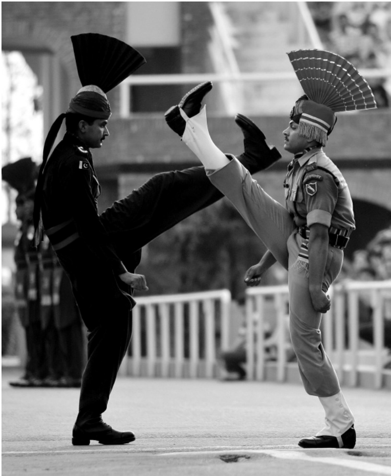
Figure 2.1 A Pakistan Ranger and an Indian Border Security Force soldier marching during the Wagah border ceremony.

shook hands and then proceeded to lower their respective flags that were placed high on poles planted at the foot of the gates. Buglers on either side played in perfect unison as both flags are lowered simultaneously and were then folded and carried away to their own stations. The commandants of both sides finally saluted each other, very briefly shook hands, and shut the respective gates with a ferocious crash.