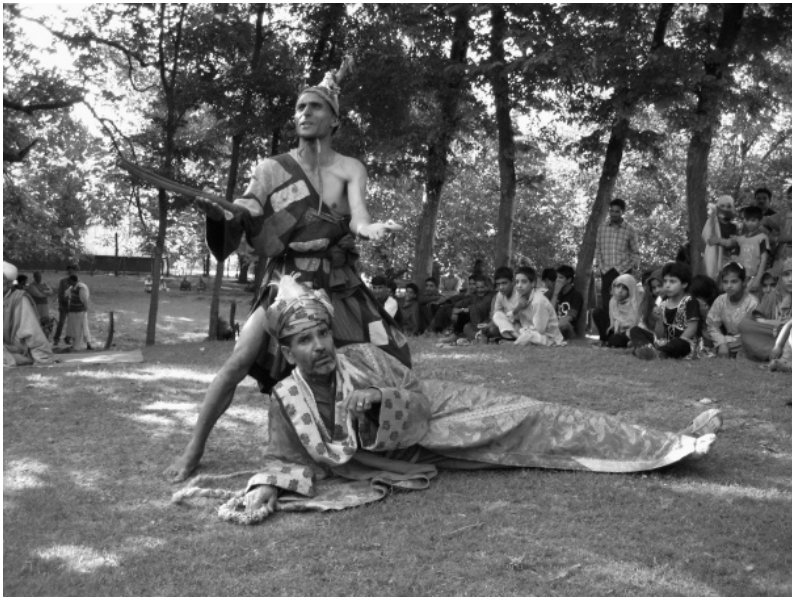
Figure 6.2 Interchangeable roles of Mashkara and Badshah, the jester and the king. Badshah Pather by M.K. Raina.

increasingly ecstatic states in the listeners. The devotional Sufiana Kalam is a spare and less structured mystical genre of poetry typically sung by a solo musician to minimal instrumentation. Qawwali and Sufiana Kalam are both performed at shrines of Sufi saints and at public concerts. Unlike Qawwali, Sufiana Kalam is sung in a monologue and requires less rigid training. Deriving from folk oral melodies, the Sufiana Kalam performers sing in vernacular languages (Gujrati, Punjabi, Kashmiri, Sindhi) to simple stringed instruments such as the tambur or ektara . Sufiana Kalam aspires toward a spiritual experience not only through the semantic content of texts but also by generating rhythmic cadences within the body.