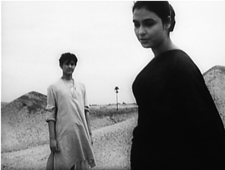
Figure 3.2 Mimetic doubles: Bhrigu and Anasuya reflect the relationship between person and place. Komal Gandhar by Ritwik Ghatak.