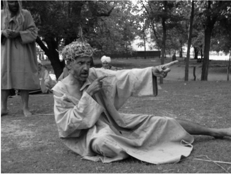
Figure 6.3 Mad Badshah on the heath.

Badshah sits down beside him, drops his head on his son’s chest, and whispers, “Rafiq!”