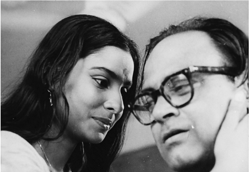
Figure 3.3 Kinship in crisis. Subarnarekha by Ritwik Ghatak.

Ghatak carefully etches out the powerful bond between Iswar and Seeta early in his film. In an intensely intimate scene between the two siblings, Iswar tells Seeta that she reminds him of their mother: “Your style of scolding reminds me of her,” he says, “the same stiff neck, same frown, same walk even. Sometimes, I get startled. I feel like I am being scolded by my mother.” Seeta strokes Iswar’s hair, “I am your mother.” Iswar raises her chin, her slender head poised upon his fingers, “You won’t leave me like our mother did?” he asks. Seeta remains silent. This scene, at once erotic, incestuous, and intimate, offers a moment to witness the ways in which the self is composed like a palimpsest, full of traces left by others. Her decision to marry Abhiram against the wishes of her brother, then, literally pulls the ground from under his feet. Her departure from his life leaves Iswar forlorn, disoriented, and orphaned. He stumbles through a preposterous world, one that leads him, at the end of the film, to seek out the sexual services of his sister.