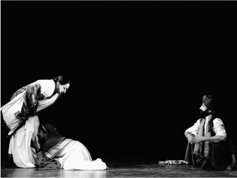
Figure 5.2 A scene of forcible recovery. Aur Kitne Tukde by Kirti Jain.

Shrimati Durgabai rationalizes her decision to discount the recovered women's opposition to their project. She says: