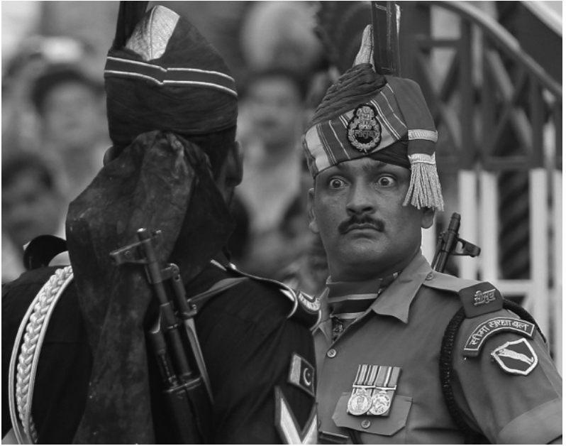
Figure 2.2 Soldiers glare at each other at the Wagah border.

The Wagah ceremony displays the magnificent power of the state at the same time that it dramatizes the antagonism between India and Pakistan. According to anthropologist Richard Murphy, the identical gestures of the soldiers across the border acquire a mirror effect through a logic of binary opposition. Drawing on theories of Lacanian psychoanalysis, he observes, “The mirror stage at Wagah is a dramatic illustration that Pakistan is defined as that which India is not. . . . On close examination this definition collapses into a dance of similitude: while the border ritual enacts difference, it also illustrates the fundamental similarities that Pakistani nationalist discourse seeks to deny.” 68 Murphy suggests that the rhetoric of difference melts into a “dance of similitude” and confounds Pakistan’s two-nation theory that held Hindus and Muslims as incommensurable ethnic groups.