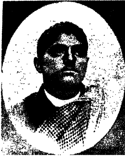
Jyotindranath Mukherjee (nicknamed Bagha Jyotin)