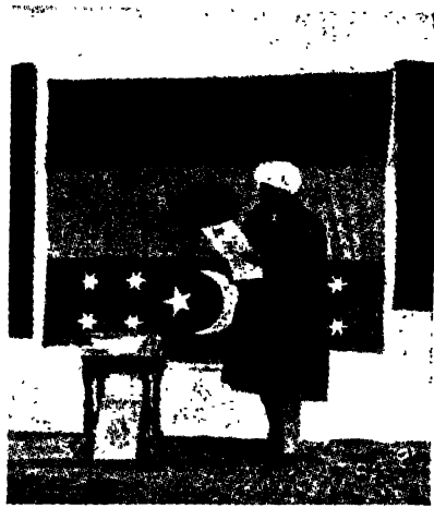
Mahendra Pratap before the flag of the Provisional Government of Free India at Kabul, in December 1915.