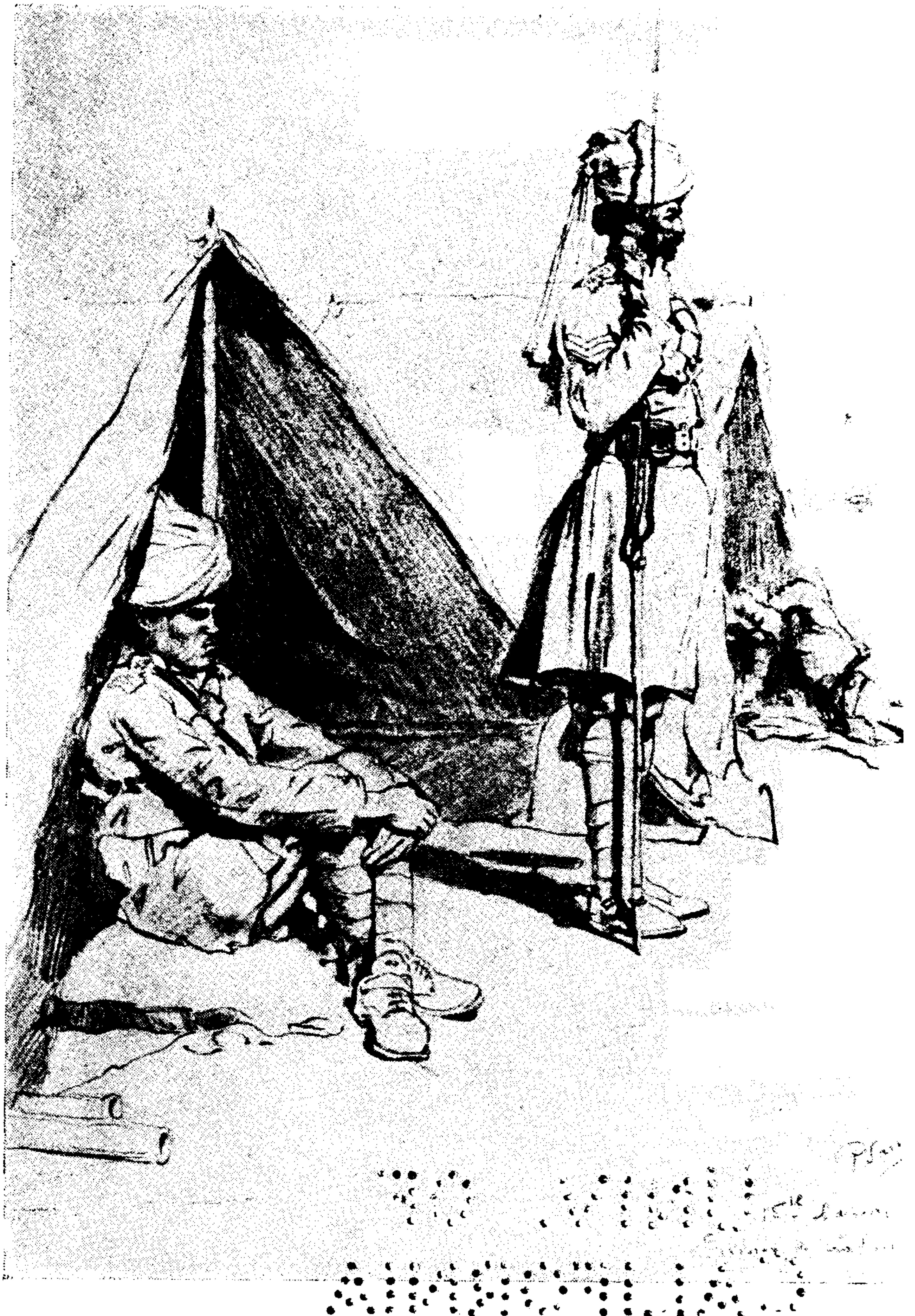
WITH THE EXPEDITIONARY FORCE. 1914.