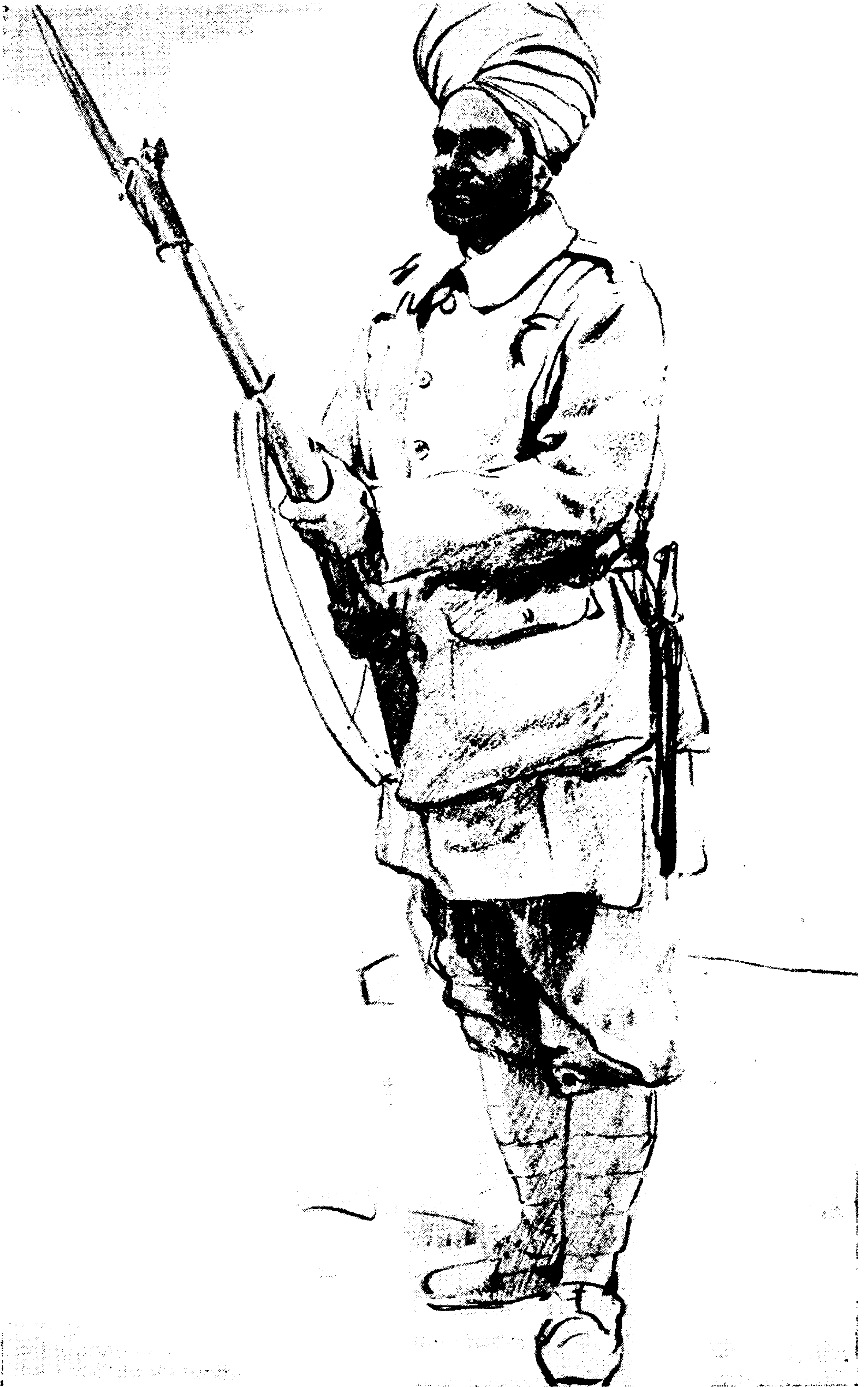
WITH THE EXPEDITIONARY FORCE, 1914.