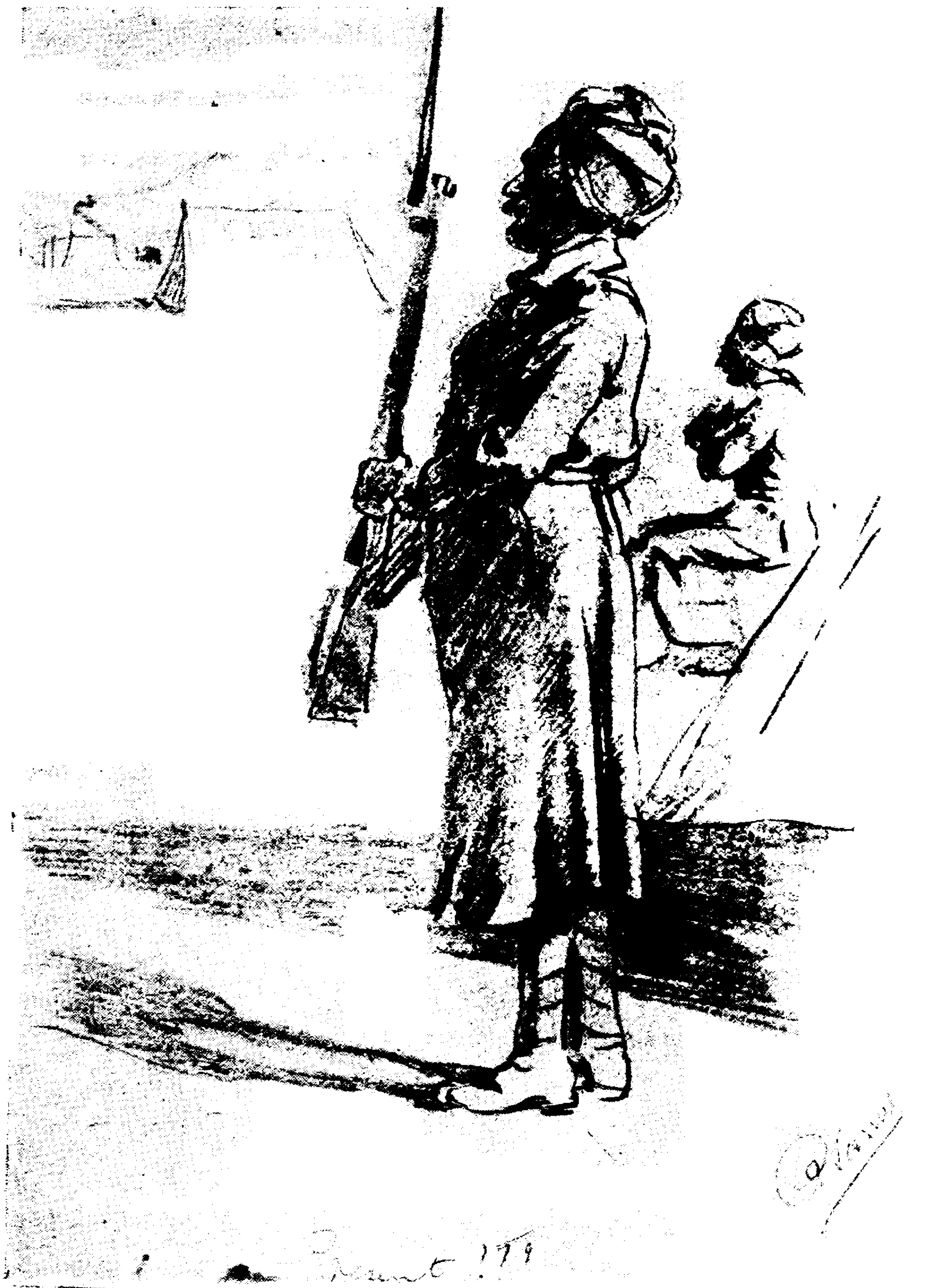
WITH THE EXPEDITIONARY FORCE, 1914.