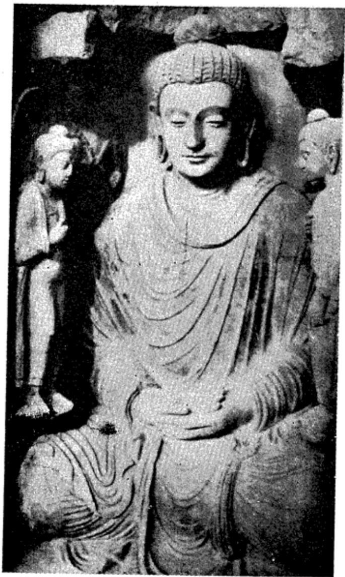
Buddha image from the Jaulian Monastery, Taxila (C. 4th-5th Century A. D.).