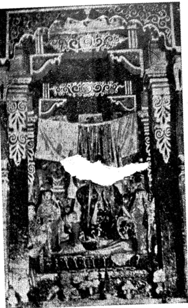
Buddha image in the Monastery at Poo in Himāchal Pradesh.